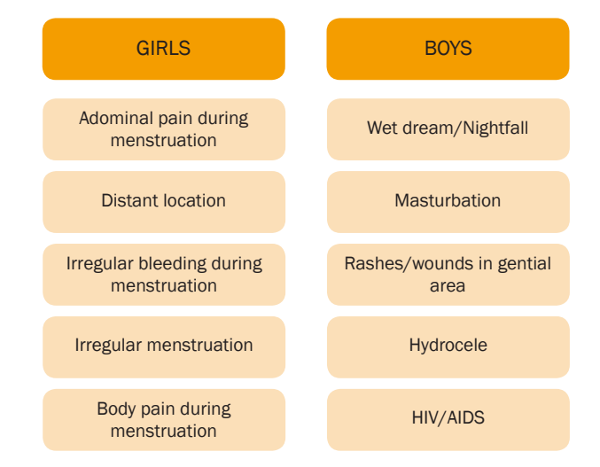
Chart 3: Top five SRH problems expressed by Adolescent girls vs. boys